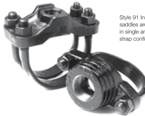
Style 91 Insulating saddles are available in single and double strap configurations.

For additional information, contact your Dresser field sales representative, or visit us at www.dresserutility.com